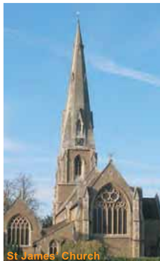
St James' Church

The landmark spire of St James' Church, Church Street can be seen throughout the town centre. Other landmarks include Oatlands Park Hotel and the Duchess of York column on Monument Green.