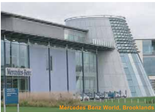
Mercedes Benz World, Brooklands

The area comprises well-established residential suburbs with a diverse mix of age and style of property including significant areas of gated private estates, pockets of ex-local authority and SPAN housing. Victorian/Edwardian properties immediately surround the town centre, smaller cottages are commonplace on roads near the river. Substantial houses and flats are located on the lower slopes of St George's Hill, with large, individually designed houses within the private estate itself. More modest properties of varying age feature in and around the Oatlands area, with 1960s development and modernist architecture along Oatlands Drive and St George's Avenue. More recently, a large housing estate has been built at Brooklands with new waterside townhouses and flats on Whittets Ait.