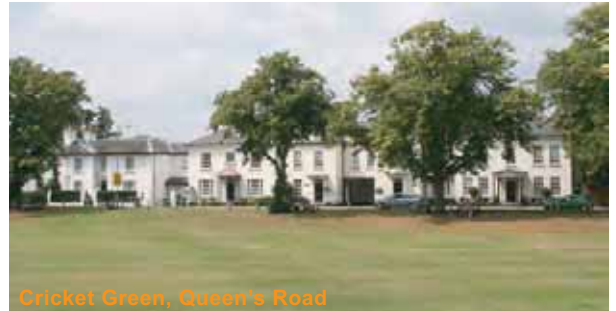
Cricket Green, Queen's Road

Greens are an important characteristic of the area. Monument Green, Heath Road Green and The Cricket Green are all key focal points for local people.